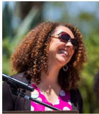
SLO Mayor Erica A. Stewart