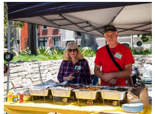
Soul Food Booth