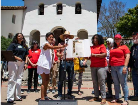
Proclamation from SLO County