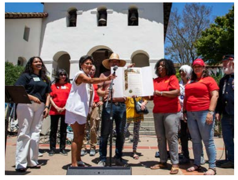
Proclamation from SLO County