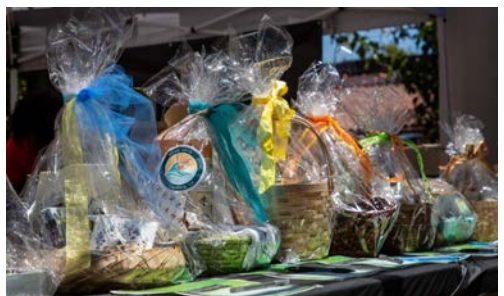
Silent auction featuring works of art, gift baskets, gift cards, wine and more