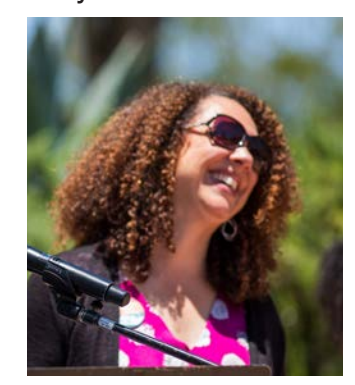
SLO Mayor Erica A. Stewart