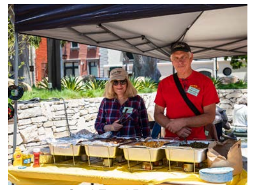
Soul Food Booth